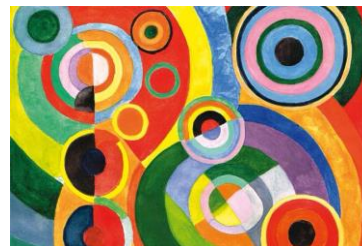
Robert and Sonia Delaunay