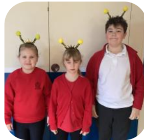
Spring Term House Points

Class 1 - Mya Class 2 - Lilly Class 3 - Brodie