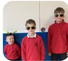
Spring Term House Points

Class 1 - Theo Class 2 - Freddie Class 3 - Coen