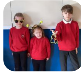
Spring Term House Points

Class 1 - Carla Class 2 - Grace Class 3 - Oliver