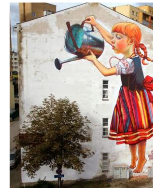
Street art in Poland