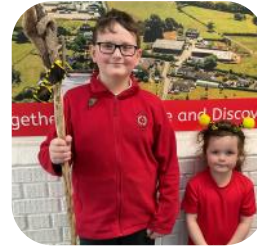
Spring Term House Points

Class 1 - Ellie Class 2 - Arlo Class 3 - Logan