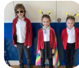
Spring Term House Points

Class 1 - Riyah Class 2 - Layla Class 3 - Ben